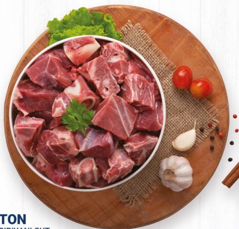
MUTTON CURRY CUT & BIRIYANI CUT SKU - 1kg