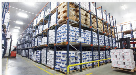
PALLETIZED COLD STORE