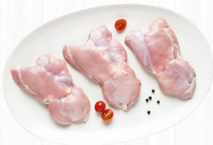
CHICKEN BONELESS THIGH SKU - 1kg