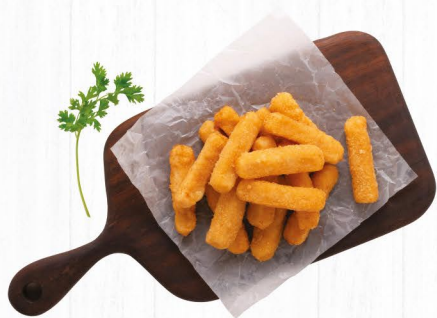
FISH FINGERS PREMIUM AND REGULAR SKU - 1kg PIECES PER KG : 60-70