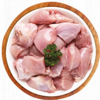
CHICKEN CURRY CUT & BIRIYANI CUT SKU - 450gm & 1kg