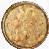
FRIED ONION PASTE