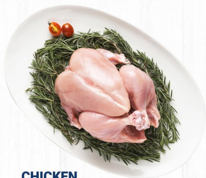
CHICKEN WHOLE BIRD WITH & WITHOUT SKIN SKU - 1kg