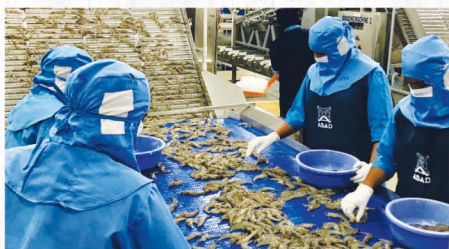
IN-HOUSE PRE PROCESSING