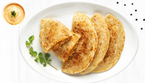
CALZONE CHICKEN SKU - 1kg PIECES PER KG : 5