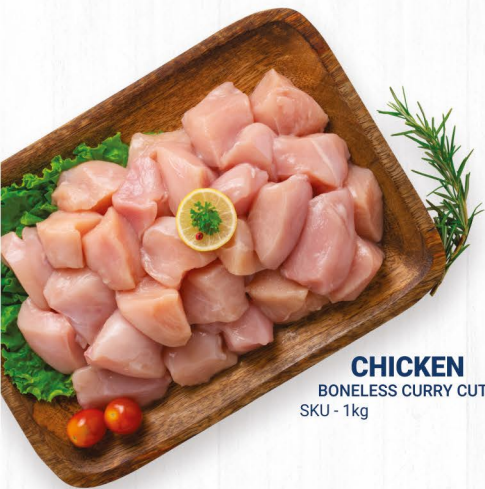
CHICKEN BONELESS CURRY CUT SKU - 1kg