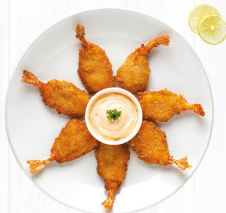
BUTTERFLY SHRIMPS SKU - 1kg PIECES PER KG : 48-52