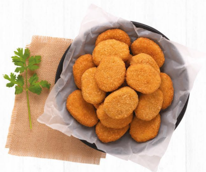
CUTLETS CHICKEN & FISH SKU - 1kg PIECES PER KG : 28-30