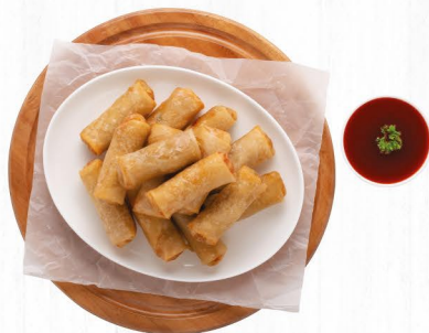
SPRING ROLLS CHICKEN & VEG SKU - 1kg PIECES PER KG : 40-45