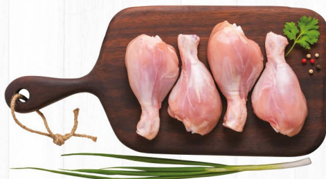
CHICKEN DRUMSTICKS SKU - 1kg