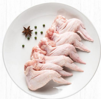
CHICKEN WINGS SKU - 1kg