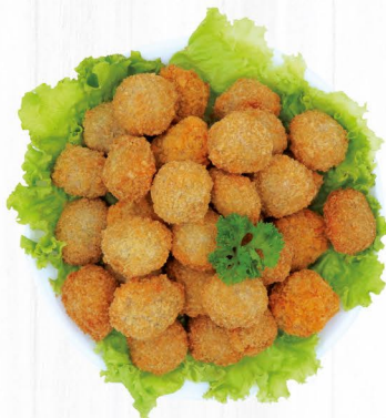
CHICKEN POPS SKU - 1kg PIECES PER KG : 140-160